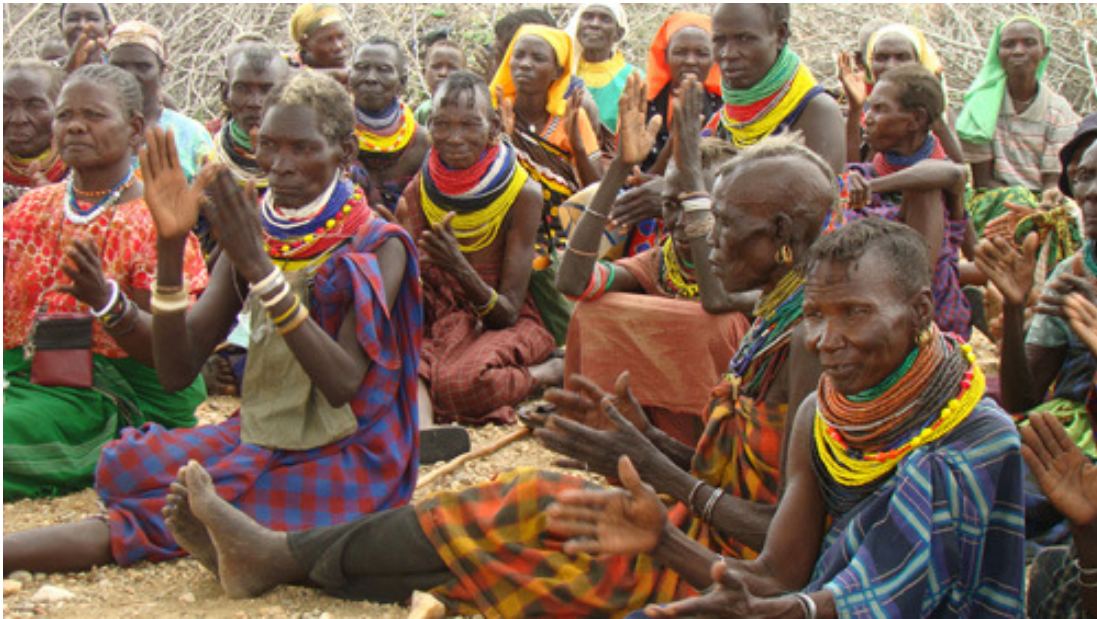
Women Participants during the shoats exercise.

Our core values: “Justice, participation and accountability”